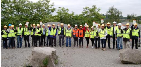
NGOs and European Commission on-site EU stakeholders visiting the SAGREX aggregates extraction site Quenast, Belgium.